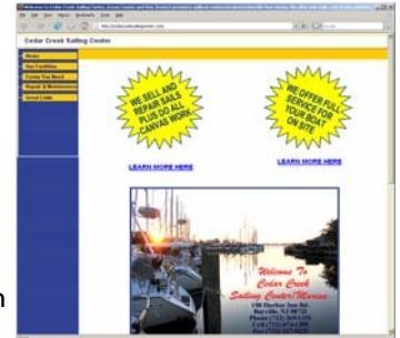
New CCSC Website!