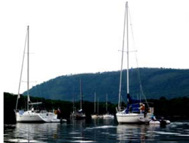
Windjammers at anchor at the base of Bear Mountain, on the Hudson River

Anyone interested should call Beach Haven Yacht Club (609) 492-9101 to reserve a slip by May 1st or sooner, (mention that you belong to the Windjammers Sailing Club), so that you can be ensured a slip.