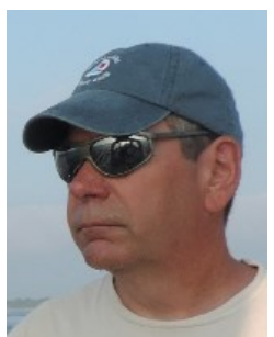
Frank Schaffer Racing