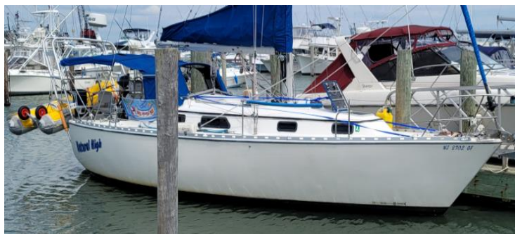
Our home away from home in our Cape May slip

The club began our journey Saturday sailing to Meyers Hole. While some of us partied on the beach, others stayed on their boats "chill-axing". They did so in anticipation of the 2:30 AM departure which was set to avoid the bad weather forecasted for Monday. Most went in for an early bedtime.