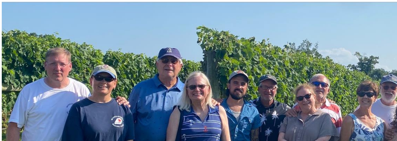
“The Group” & “The Grapes” ...

Natural High is looking forward to our next adventure with our fellow Windjammers... See you all next season!