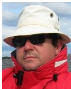
Chip Hitchens Website