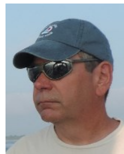
Frank Schaffer Racing