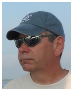
Frank Schaffer Racing