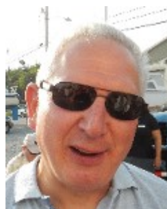
Rich Conti Seminars