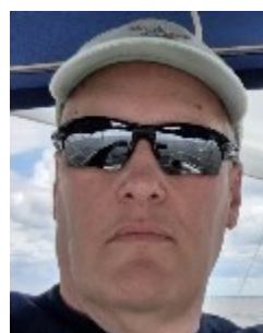
Jim Priestley Supplies